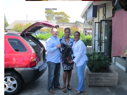
State Farm Donation